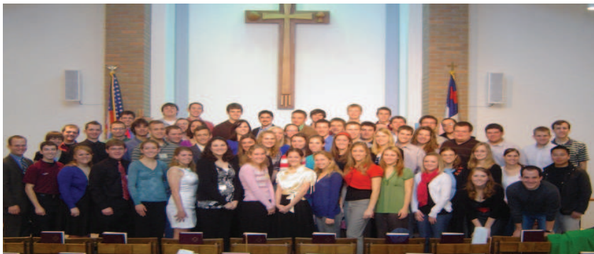
Group photo of members of ULC, 2009-2010.