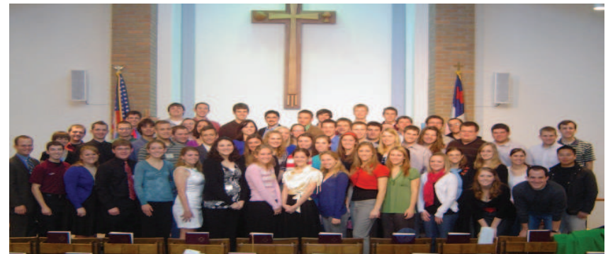
Group photo of members of ULC, 2009-2010.